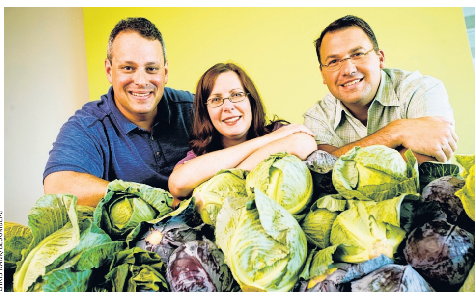
The leadership of Kabbage at their offices in Atlanta.

The information will be used to help determine whether these firms and others are operating with appropriate licensing and supervi-